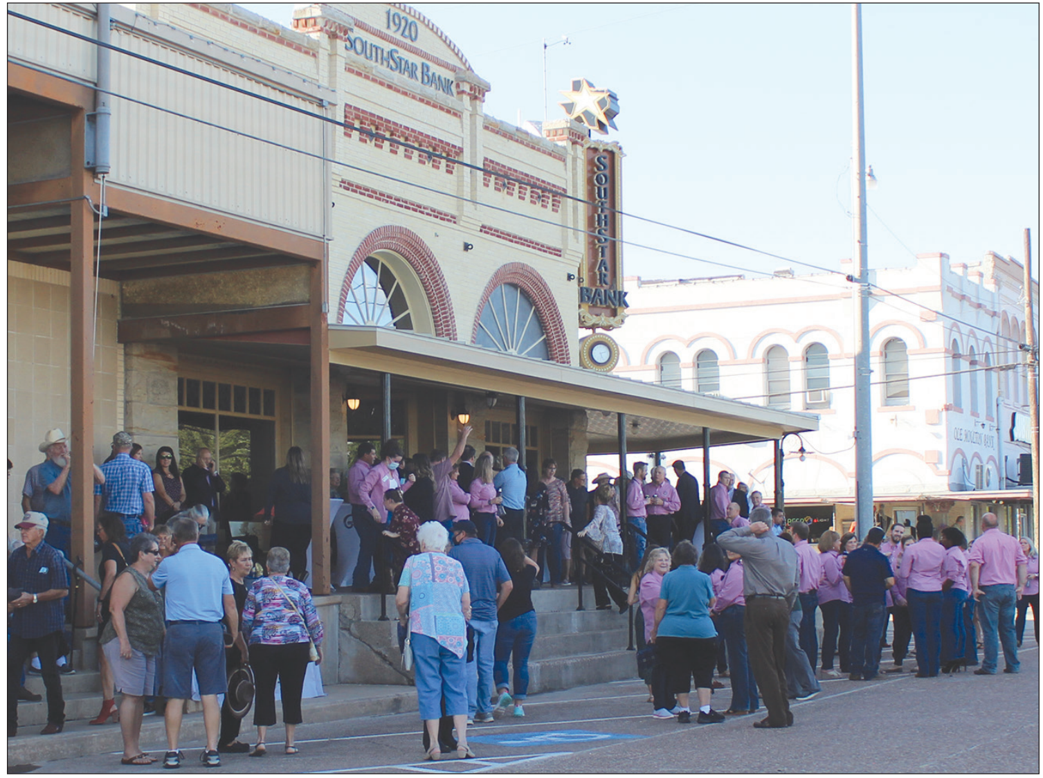
A centennial celebration was held on Wednesday Oct. 21 at SouthStar Bank headquarters in Moulton. Tours of the newly renovated building were given, and the event included live music, food and games. (Brooke Sjoberg)